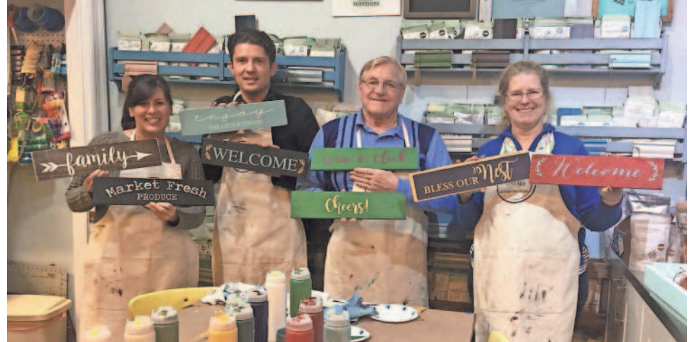
The sign-making workshop at Hudson Valley Vintage is a fun DIY project for Valentine's Day.

Whether that means building a blanket fort in the living room or lighting